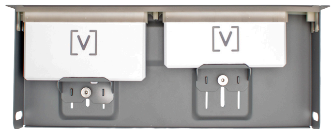
Top View (Route10 and S8-POE Installed)