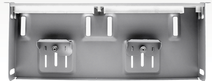
Top View (No Products)