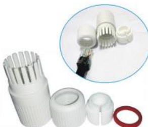
GNT-5313Cover Four set waterproof Cover (Optional)