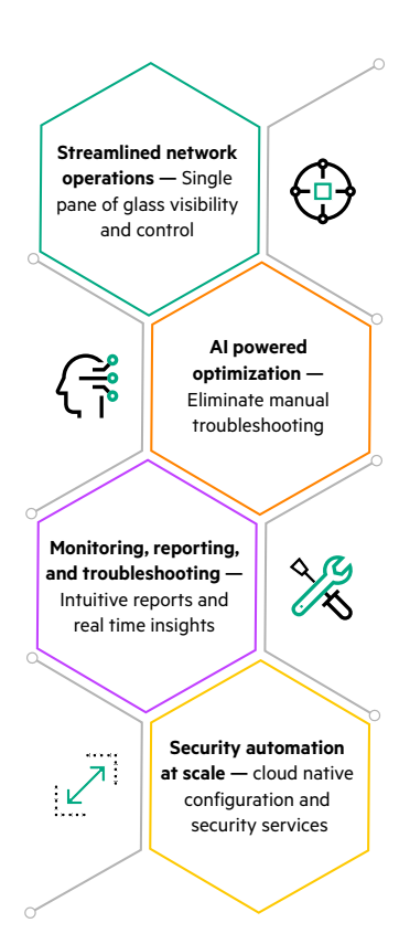
Figure 1. Key features of HPE Aruba Networking Central