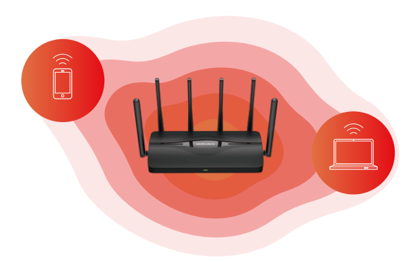
MR47BE with Beamforming

6× omni directional antennas, proprietary Wi-Fi optimization, and Beamforming technology deliver broader coverage, more capacity, stronger and more reliable connections, and less interference.