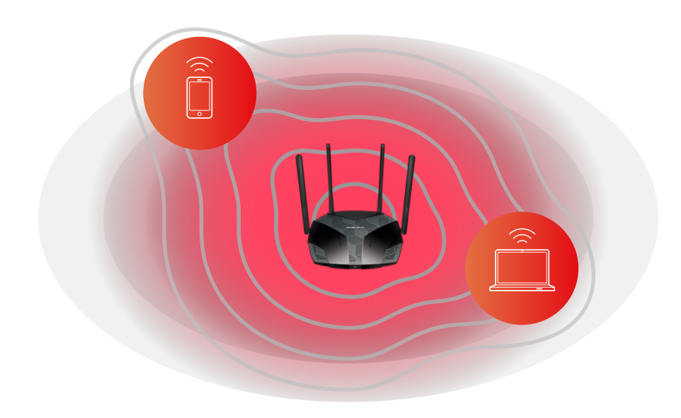
MR60X with Beamforming

Four powerful high-gain antennas armed with advanced wireless technology provide strong signals throughout your home. Beamforming detects your connected devices and concentrates wireless signal strength towards them, making your connections more stable.